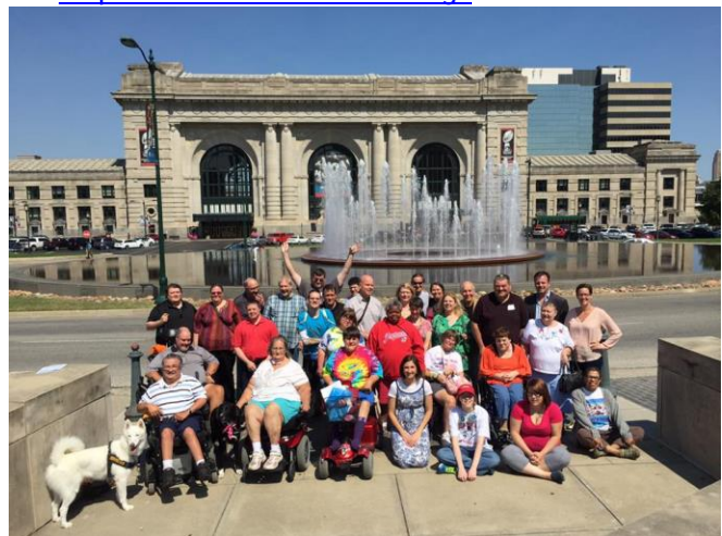
- Heartland Self Advocacy Resources Network

The Governor’s Council on Developmental Disabilities is seeking interested individuals to serve. To learn more go to - http://iddcouncil.idaction.org/