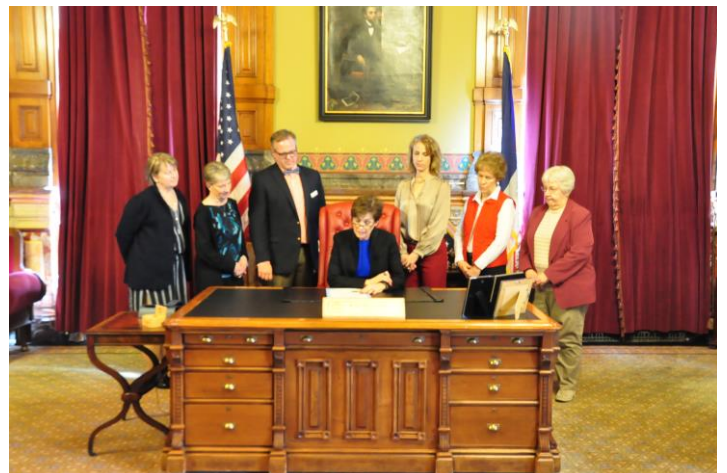
- Signing the proclamation; March as Disability Awareness Month